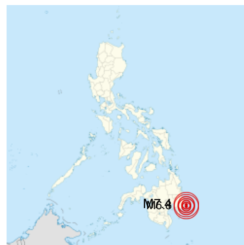
2025 Davao earthquake (Philippines)